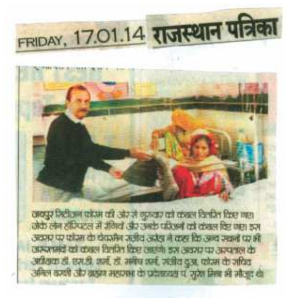
अवलय पर प्रमाहमतीकी के संजीत्त कुआ, प्रेम महित को आपनी। गौरतालब है कि के क्रम्बात राधस्थान मेरबार को प्रायम रजु तेन, काने मोडाप्य, तीपने क मे आपने और केवरीय सोधे आनव कार्य के प्रवास अवाय, जॉनी सक्वड कोर प्रोयेआत कराए थे। इस के कह प्रमर्थसीयों लि. ने प्रशतस्थ कराए थे। इस

बाम्प्रेल महित जन्म जरूनी सामग्री भी जितलि